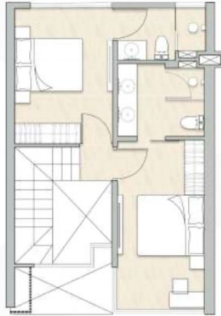
DUPLEX TYPE (UPPER FLOOR) 38.48 sq.m.