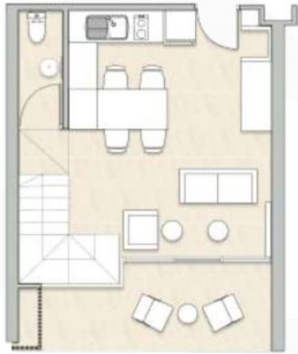
DUPLEX TYPE (LOWER FLOOR) 44.83 sq.m.