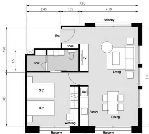
TYPE D Area 51.06 sqm.