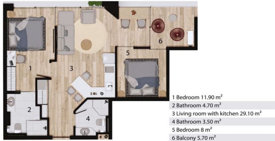
TYPE G: 2 BEDROOM APARTMENTS