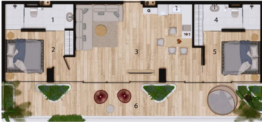
TYPE L : 2 BEDROOM APARTMENTS

Total area - 86.3 m 2 Total apartments - 1