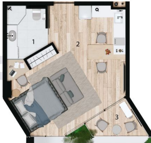
TYPE C: STUDIO APARTMENTS