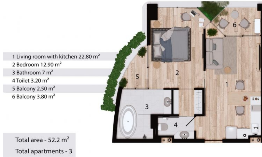
TYPE E : 1 BEDROOM APARTMENTS