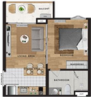
1st floor TYPE A: 36 SQ.M.