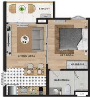
2nd- 7th floor TYPE A: 36 SQ.M.