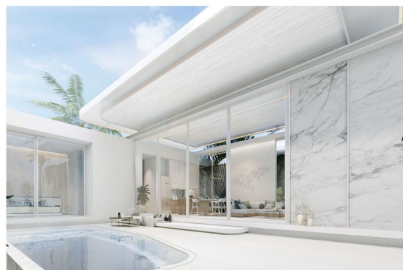
PROJECT RAWAI Phuket

Stage: Design Location: Phuket Type: Villa