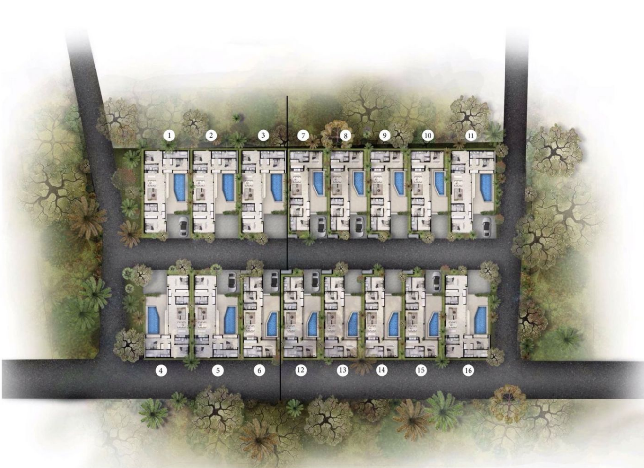
Stage: Design Location: Phuket