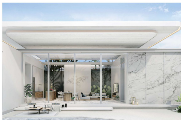
PROJECT RAWAI Phuket

Stage: Design Location: Phuket Type: Villa